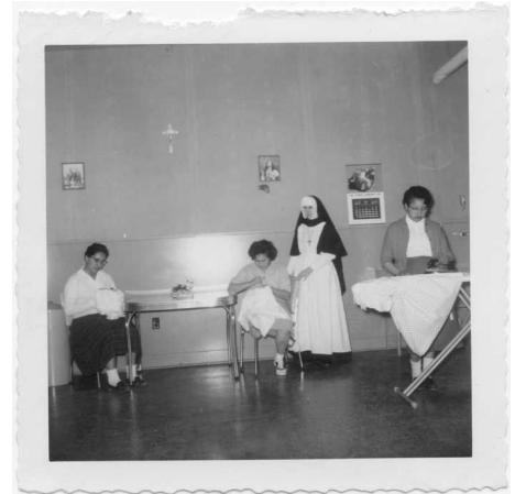
St. Mary's Indian Residential School http://archives.algomau.ca/main/book/export/html/24019

The ban on Indigenous languages created tremendous confusion and tensions among the students. Many of the students did not speak English when they entered the schools and could not possibly understand what was expected of them. For others, speaking the native tongue was a form of resistance – a way to hide from the school staff their true emotions and thoughts. But the schools usually responded to the use of native languages forcefully. Stolen Lives Pg. 1