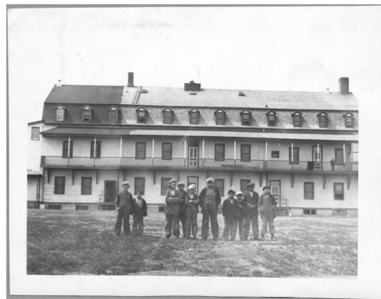
Ermineskin (Hobbema) Indian Residential School.